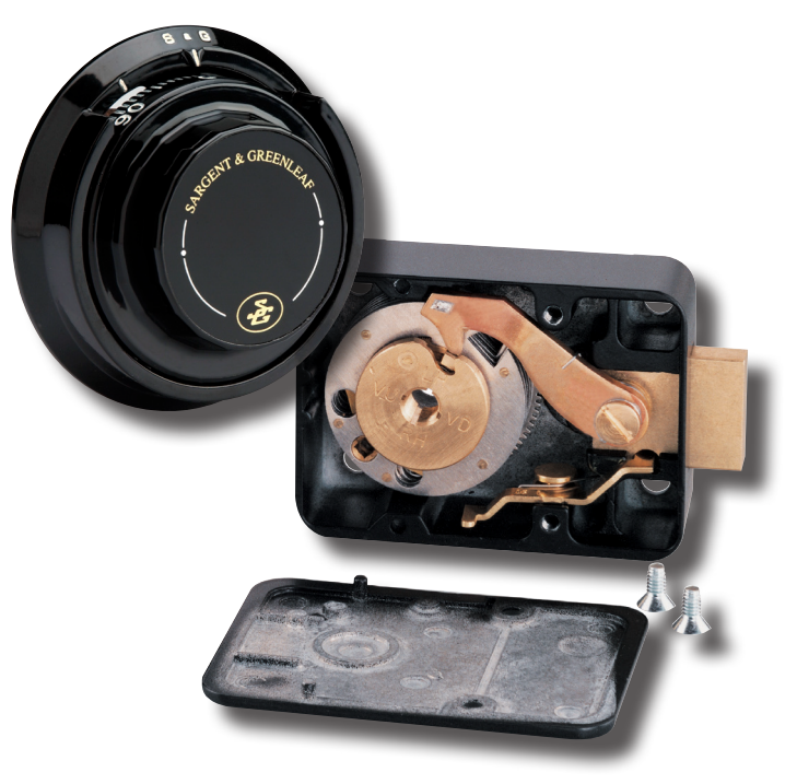
Built in America by an American owned manufacturer.