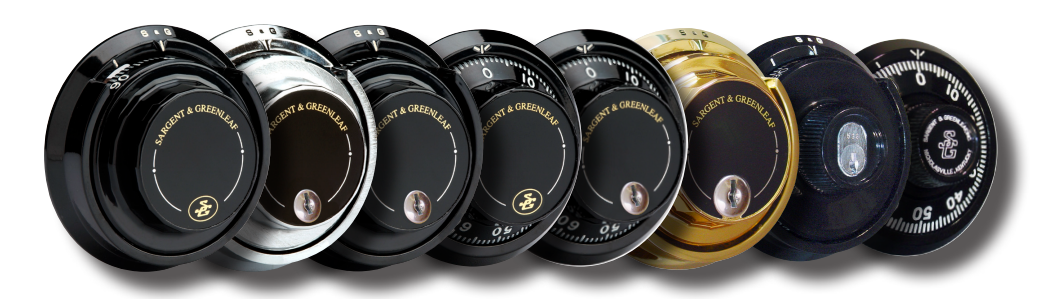
A Wide Variety of Dials and Rings

The support of the industry leader. S&G is one of the world's largest manufacturers of high-security safe and vault locks, with a broad array of locks, based standards, unsurpassed in quality. We provide excellence in all areas - from our ISO 9001, U.L. and other worldwide certifications to our experienced customer service and technical support staff. We proudly stand behind all of our products with one of the best warranties in the industry.